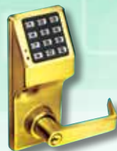
Lever set in US3 DL2700/3