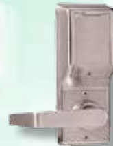
Secure battery compartment on inside door