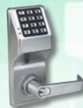
With IC Core in 26D DL2700IC/26D