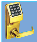
Weather-Resistant Lever in US3 DL2800/3