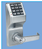
Weather-Resistant Lever with IC Core in 26D DL2800IC/26D