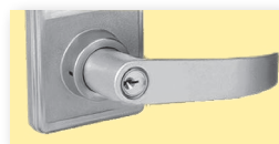
Regal handle option

PDL3000K: Model logs mechanical key override use and has a standard interchangeable core prep.