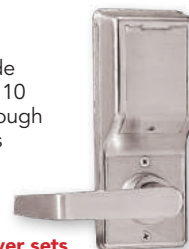
Lever sets feature clutch mechanism ensuring longer life and complies with ADA specs providing barrier-free access to the disabled.